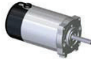
PM11 pictured with Parvalux standard flange