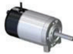
PM8 pictured with Parvalux standard flange